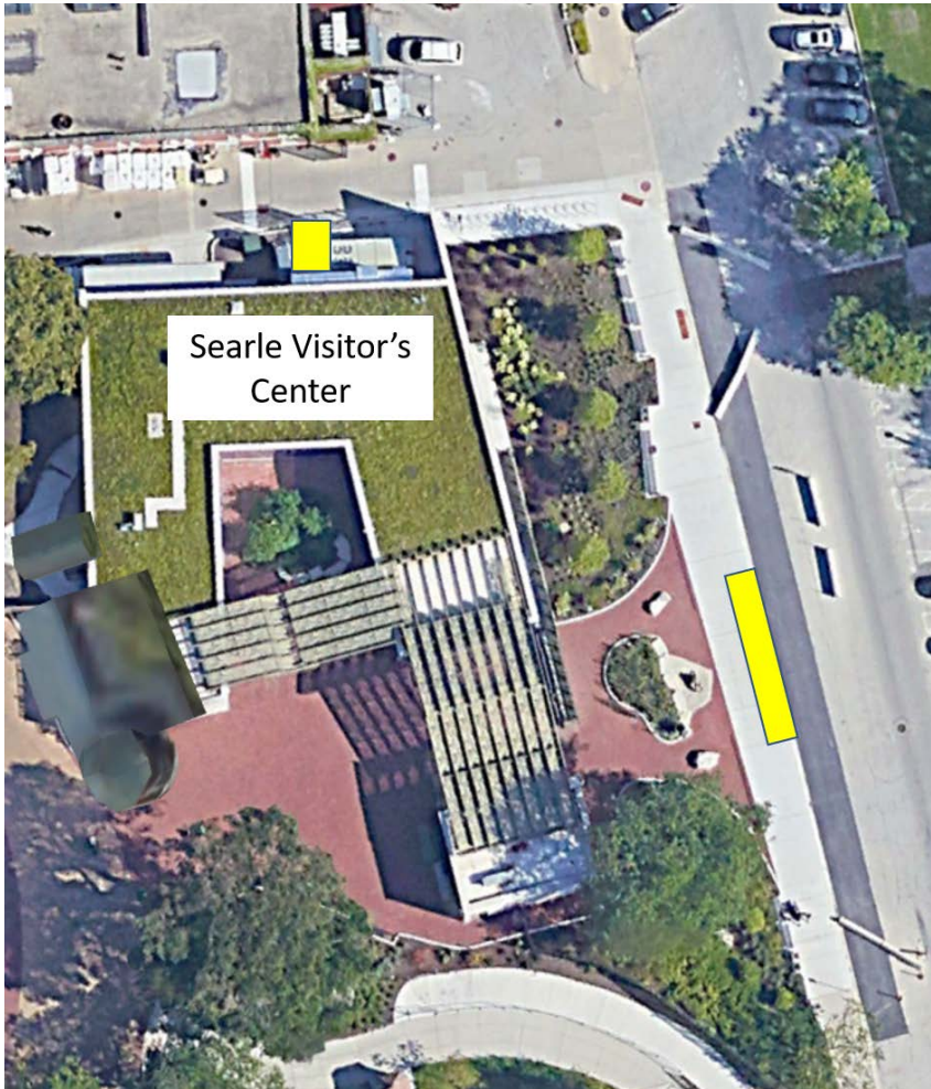
Searle Visitor's Center