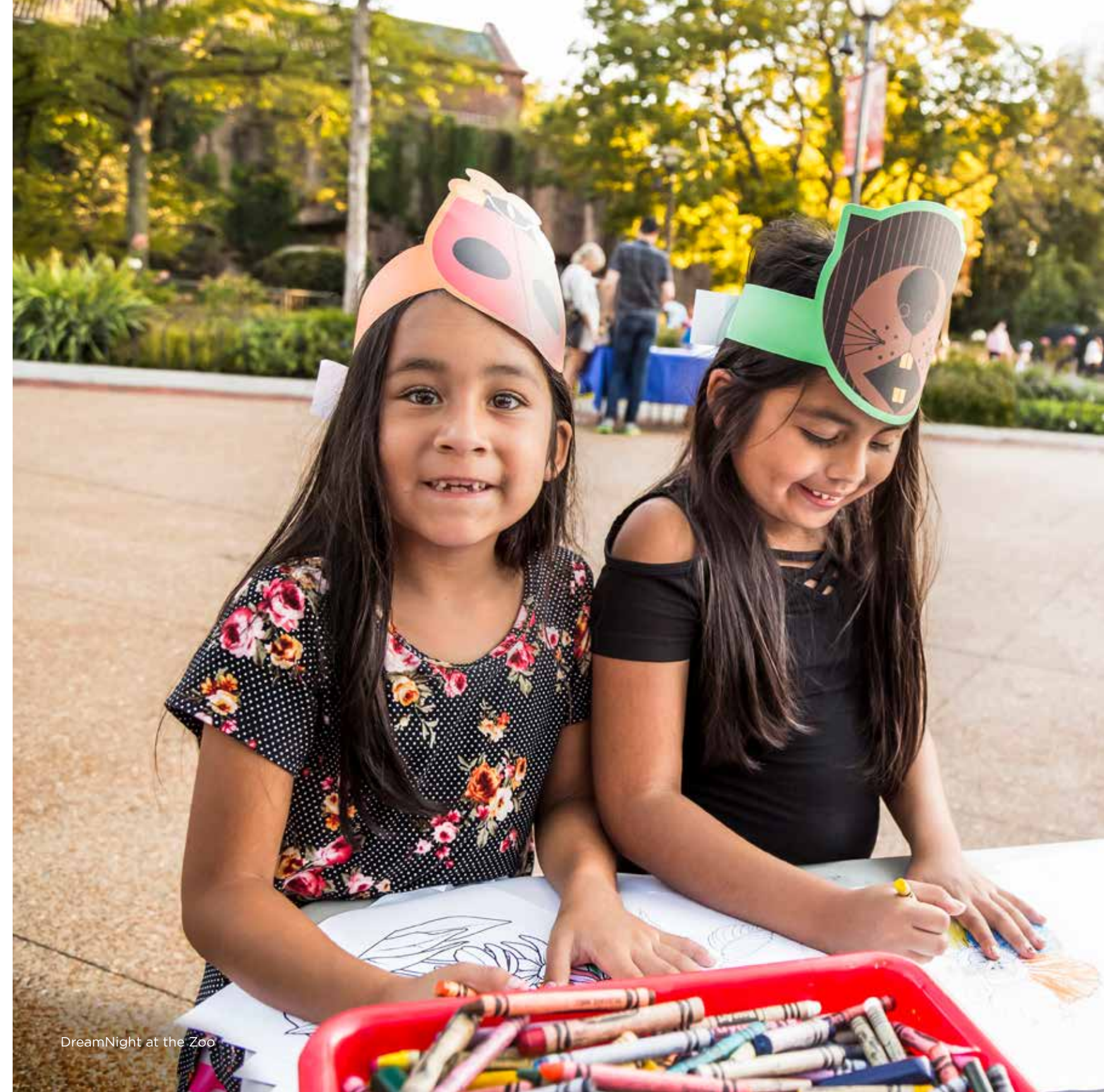
DreamNight at the Zoo

The zoo launched The Zooalogue Project, an institution-wide initiative designed to encourage informal discussions about race and ethnic diversity. These voluntary one-on-one meetings give zoo employees the opportunity to share their experiences and perspectives with each other while promoting positive cultural differences and similarities through healthy conversations.