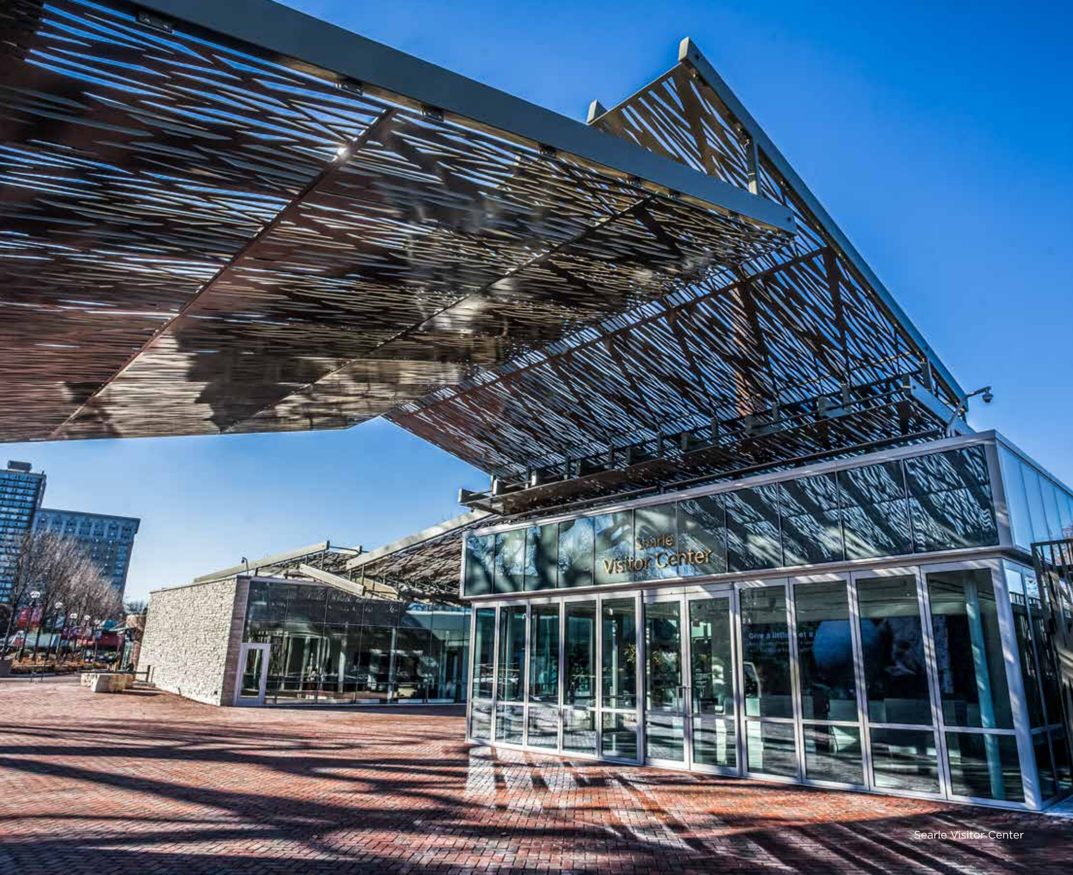
Searle Visitor Center