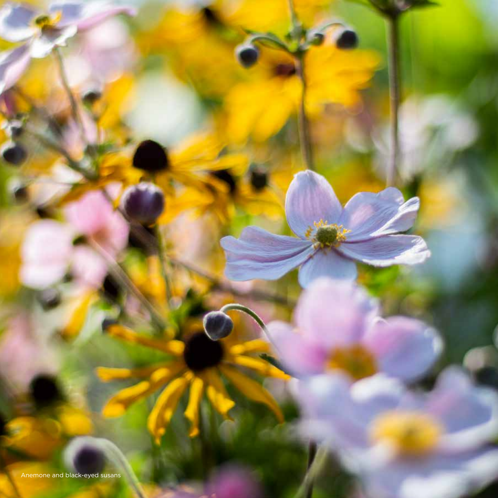
Anemone and black-eyed susans