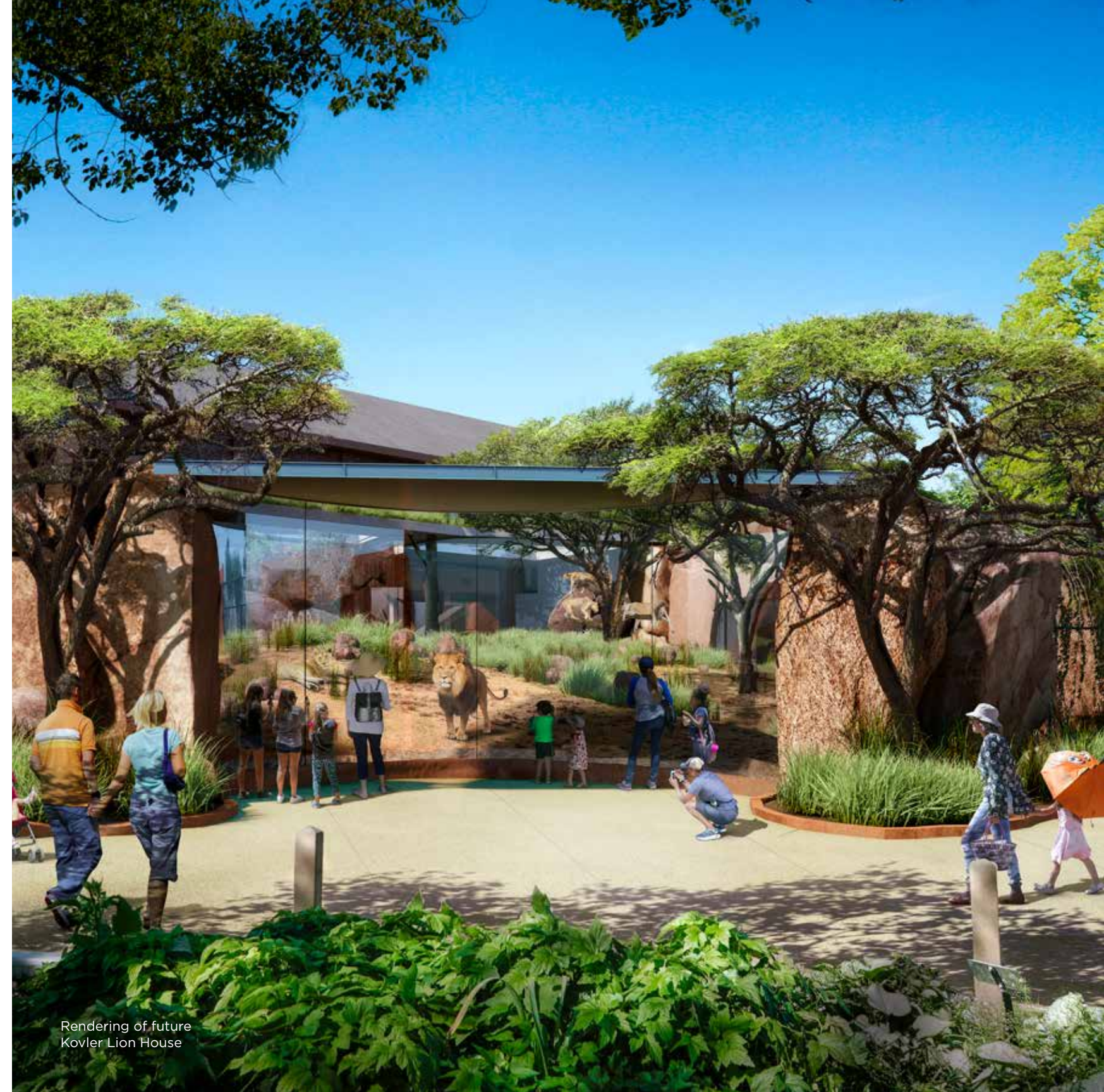
Rendering of future Kovler Lion House

Interested donors can make a gift today at lpzoo.org/pride or 312-742-2179.