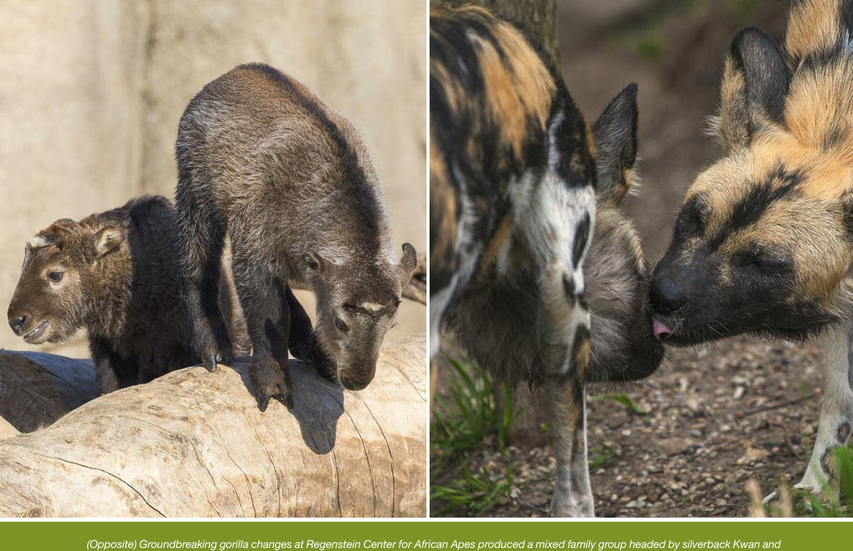
(Opposite) Groundbreaking gorilla changes at Regenstein Center for African Apes produced a mixed family group headed by silverback Kwan and the zoo's first-ever all-male bachelor troop. (This page, clockwise from top left) new arrivals included takins Mengyao and Xing Fu, an all-female African wild dog pack, Kenya crested guineafowl, red river hogs and Grevy's zebra colt Kito.