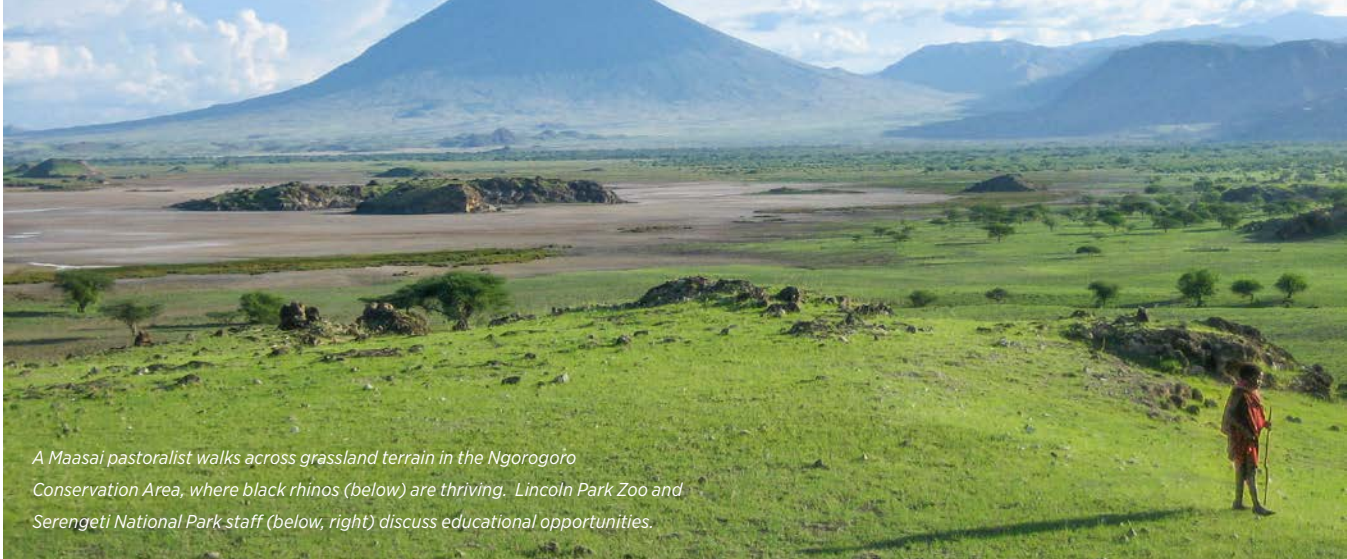
A Maasai pastoralist walks across grassland terrain in the Ngorongoro Conservation Area, where black rhinos (below) are thriving. Lincoln Park Zoo and Serengeti National Park staff (below, right) discuss educational opportunities.

if the park no longer existed. Many responded, “I’d be sad” or “It contributes to the national economy” even if they don’t see the benefit themselves.