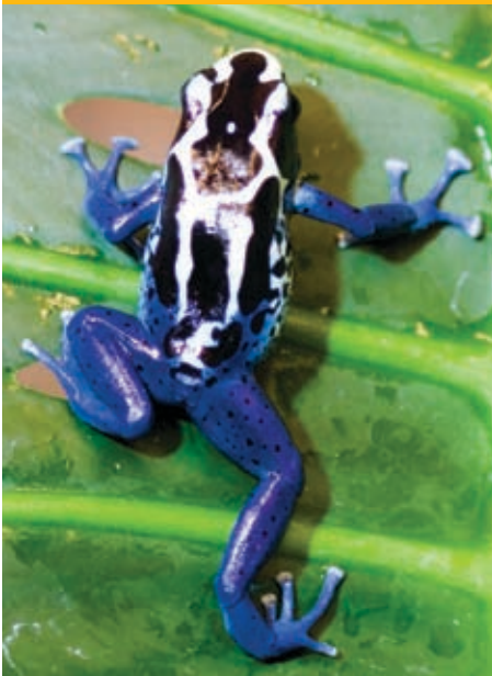
Dyeing poison arrow frogs are among the colorful residents of Regenstein Small Mammal-Reptile House.