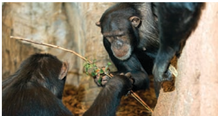
Chimpanzees “fish” for treats at the termite mound inside Regenstein Center for African Apes.

Contingent Bequest – “In the event that _____ predeceases me, I give The Lincoln Park Zoological Society, Chicago, Illinois, 60614, the sum of $_____”